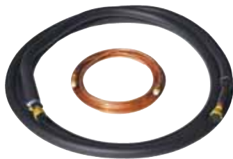
LINESET WITH FITRIGHT™ FITTINGS